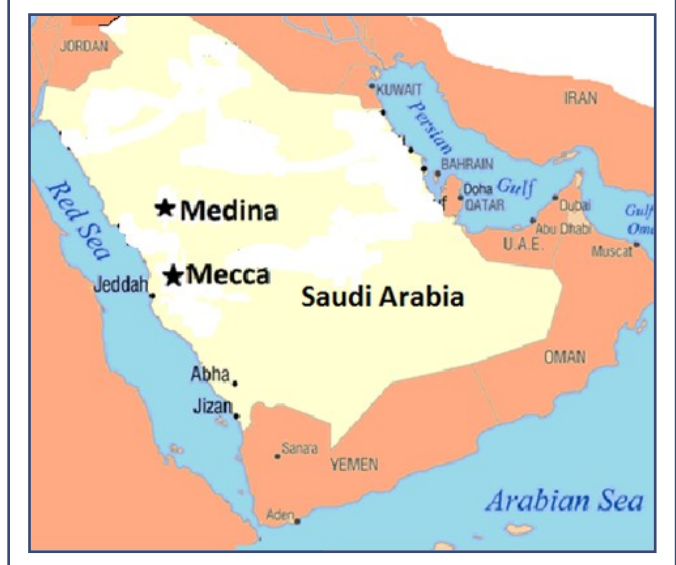
Figure 1 : Map of Saudi Arabia

Islam was born in Saudi Arabia. The holy cities of Mecca and Medina are located to the south west of Saudi Arabia (Figure 1), geographically located between the Arabian Gulf to the east and the Red Sea to the west. Its physical location is not viewed as a major tourism pull factor, however, many researchers argue that religion acts as a robust tourists pull factor