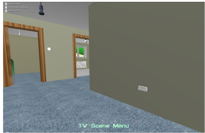
Figure 3 Screenshot of a virtual scene in VES