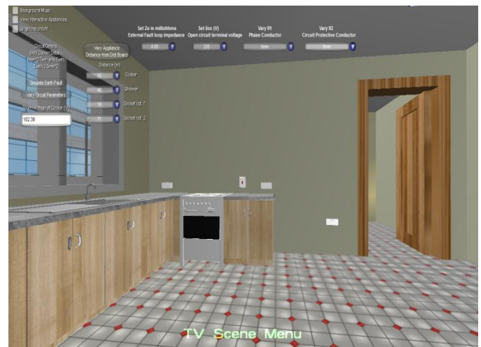
Figure 1 Screenshot of real-time interactivity provided in VES

Real-time interactivity is another feature of virtual reality. This can be defined as a virtual reality system's ability to detect a user's input and respond instantaneously. Designed correctly, a well refined interface used to capture and respond to user commands can afford a heightened sense of immersion. An example of real time interactivity provided in VES is shown in Figure 1.