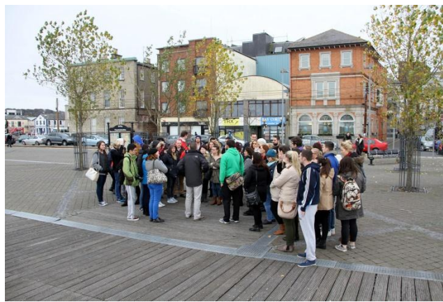
Figure 2.4: Students on a site visit in Wexford