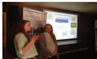
Figure 2.6: Students presenting their findings

The event was attended by a number of members of the County Wexford Age Equality Network who took part in the Students in Action Project (Figure 2.7).