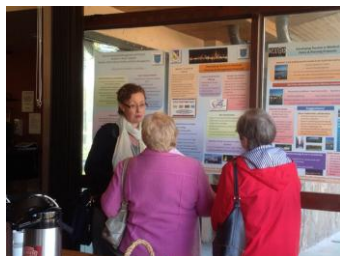
Figure 2.5: Poster presentation