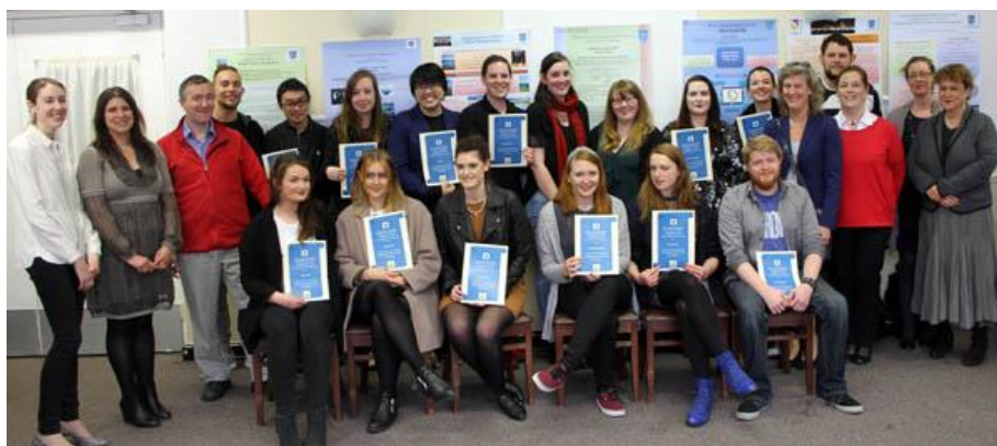
Figure 2.8: Students in Action Award Ceremony