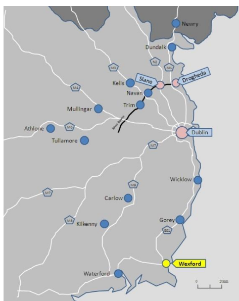
Figure 2.1: Wexford town, the destination chosen for the 2014/2015 project