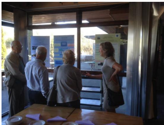
Figure 2.7: Members of the County Wexford Age Equality Network attending the feedback event in Wexford