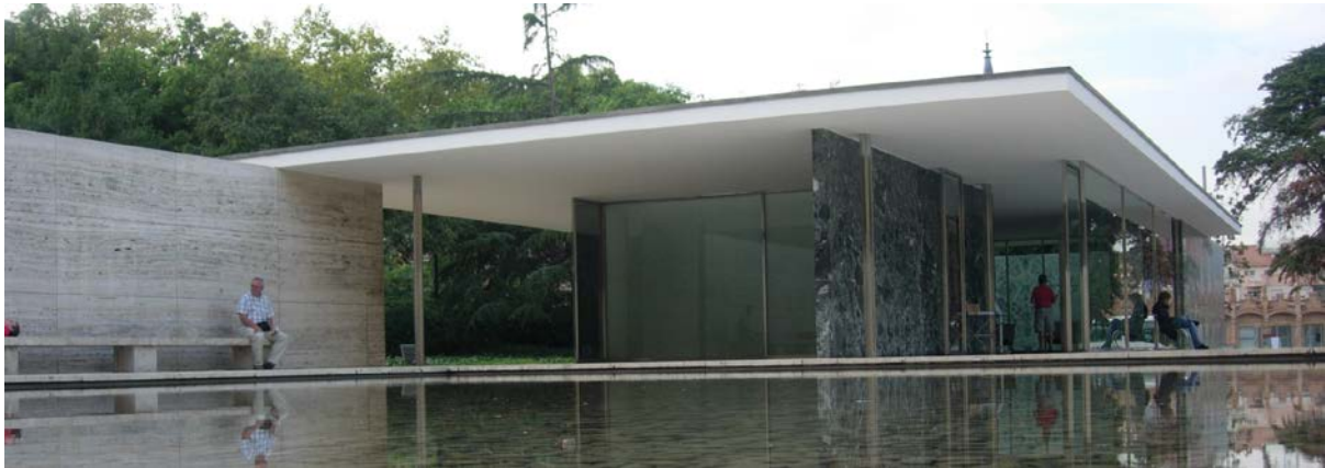
1929 Barcelona Pavilion reconstruction by Mies van der Rohe i

The German Pavilion in Barcelona, one of the world's most famous architectural set pieces, is a structure that is barely architecture; being neither villa nor monument. Mies van der Rohe took the opportunity of the commission to distil a view of what architecture could be. In this moment of optimism a number of ideas were concretised and if history had been kinder a different future might have resulted. Hidden in full view is a symbol, a signature of sorts, one that remains stubbornly German. “There is, ..... something else, something deeper down and thus something more hidden, something that has not yet been revealed.” ii -