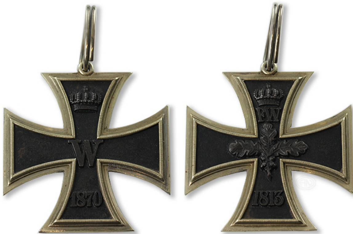
1870 Grand Cross of the Iron Cross xxi

Mies was 42 when commissioned to undertake the design of a showcase for German Industry. Germany was heading towards a crisis which would result in the fall of the Weimar Republic in 1933 and the compensatory rise in fascism. Mies was 42 when commissioned to undertake the design of a showcase for German Industry. In 1929 months after the opening of the Pavilion, Frankfurt would host CIAM II devoted to “Die Wohnung für das Existenzminimum” (The Dwelling for Minimal Existence). Mies was maturing as an architect just in time to see the promise of this new world of steel, glass and concrete come into existence. In a sense the Republic sought out an architect who would encapsulate this new world through the medium of the pavilion. The ‘matter of factness’ of the pavilion was in keeping with this new world.