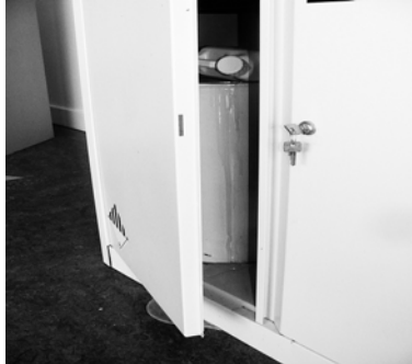
Figure 2 Chemical Cupboard

The second hazard was the chemical cupboard shown in Figure 2. This consisted of a cupboard with a “staff only” sign, an open lock with the key left in, several containers with evident hazardous substance symbols being visible and a simulated leak onto the floor.