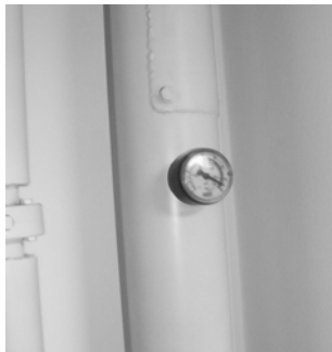
Figure 3 Leaking Pipe

The second hazard was the chemical cupboard shown in Figure 2. This consisted of a cupboard with a “staff only” sign, an open lock with the key left in, several containers with evident hazardous substance symbols being visible and a simulated leak onto the floor.