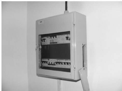
Figure 1 Switchbox

A professional prop company produced three realistic (but not hazardous) hazards for the experiment. The three hazards were: a leaking chemical cupboard, a faulty switchbox and a leaking pipe. The “hazards” were placed around the risk lab exhibition before it was open to the public. The fuse box was placed near the entrance lobby, the pipe was placed in a busy corridor and the chemical cupboard was placed at the top of the main staircase in the exhibition.