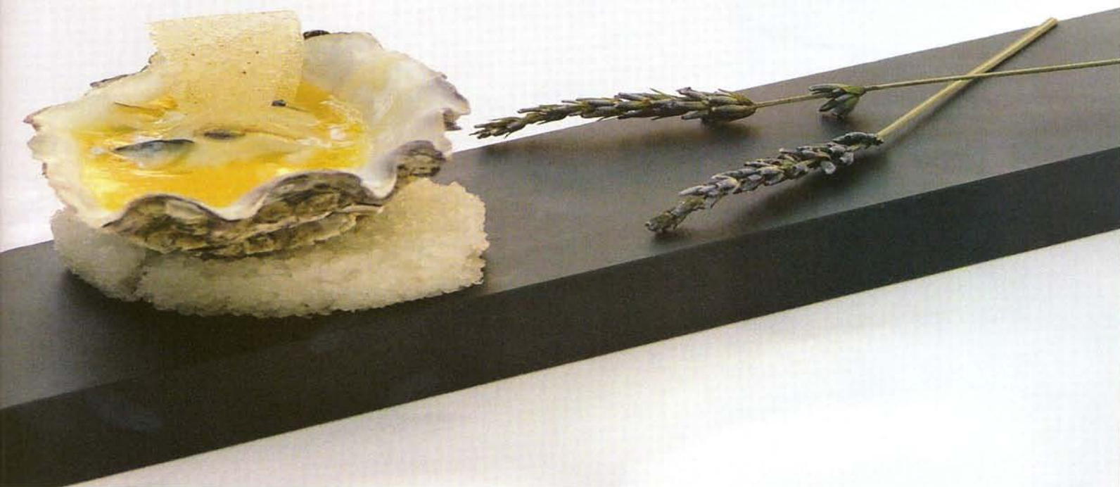
From left: Sardine on toast sorbet, ballotine of mackerel 'invertebrate', marinated daikon and salmon eggs; Fresh oyster with passionfruit jelly, horseradish cream and lavender

marvellous dish. The 'sorbet' resembled a chilled fish paté in texture and the mackerel served with pickled ginger was divine. On sipping the wine the dishes' flavours re-awakened in the mouth like an organoleptic explosion. Our waiter who had sampled the tasting menu with wine the previous week (a yearly perk for all staff) mirrored my delight in this magical food and wine pairing.