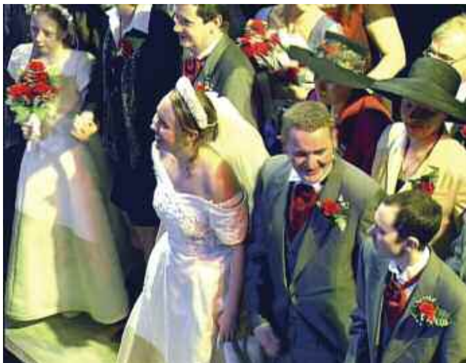
Image from The Wedding community play.

On the evening of Saturday 27 November 1999, the last performance of The Wedding took place. That night, at almost exactly the same time, David Trimble was making a landmark speech in Belfast’s Waterfront Hall and the UUP voted in favour of supporting the Mitchell Review of the GFA 15 which would play a key role in establishing the NI Assembly. The play was absolutely ‘of its time’ and eight years later there is still huge resonance and considerable learning for the wider theatre and peace-building community.