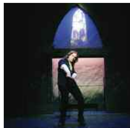
Dundalk Crossover group member.

Through accident rather than design, two of the Crossover groups have been all-female.