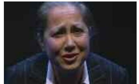
Various images from Smashing Times Theatre Company.