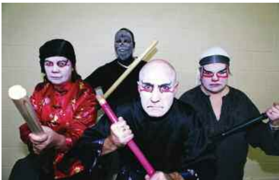
Creative Training performance.

building, conflict and equality in a wider context as well as within the Irish one. Drama and theatre enabled them to explore individual and group stereotypes and perceptions, and themes of conflict ran throughout the course, for example violence, sectarianism, paramilitary activity and racism.