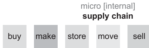
Figure 1.2: The Internal Supply Chain