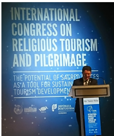
Figure 2 : UNWTO recognition for Religious Tourism and Pilgrimage - Mr Taleb Rifai (Secretary General, UNWTO) speaking in Portugal, November 2017

As can be seen in the discussion above, Religious Tourism and Pilgrimage are substantial motives for the global movement of people. Whether this travel is for purely religious motives, or whether pilgrimage is influenced by some secular desires, or even if the journey is undertaken for entirely profane motives is not being discussed in this reflection. The main issue being highlighted here is the breadth and intensity of this form of religion-linked travel, which goes largely