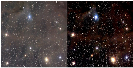
Figure 2: Fractional diffusion based deconvolution (right) of a dust clouded star field (left) in the constellation of Perseus.

for an optical image obtained by the Hubble Space Telescope (part of the constellation of Perseus observed through an interstellar dust cloud that covers nearly 4 degrees on the sky and observed approximately 1,000 light-years away).