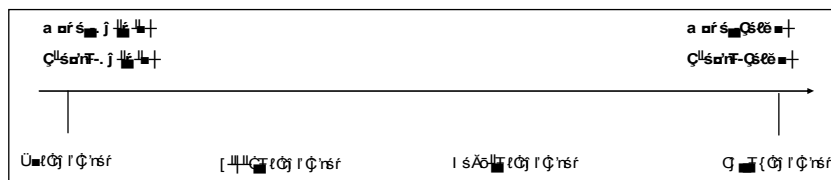
Figure 1 Spectrum from Unstructured to Fully Structured Interviewing, and Possible Relationship to Phases in the Development of a Theory [1]

SSDIs are further categorized into two classifications, Heavily Structured Depth Interviews and Lightly Structured Depth Interviews. The degree of structuring is determined by the degree to which the questions and interventions are pre-prepared by the researcher. Figure 1 shows the relationship between structured and unstructured interviews.