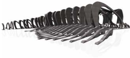
Fig. 3. Market Structure

The project becomes a cycle of symbiotic relationships through time. As the structure emerges slowly coral grows on foundation elements in the water allows for anchoring of the structure on the shore. As the structure emerges from the water, the skin will be applied. The structure will eventually take form while the coral and animal growth continues. Eventually the structure will begin to become part of the coral, as layers emerge, decay, and return to earth. The structure erodes while the coral growth thickens over time. Eventually the part of the structure in the ocean will decay and be "reclaimed" by the animal.