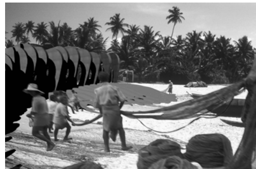
Fig. 2. Market fishermen untangling nets