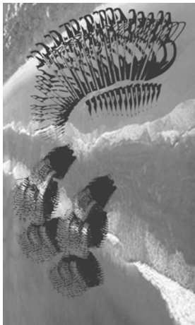
Fig. 4. Plan

The coral forms in the water depict a complex "growing" structure. At the location of the shoreline, the polyps grow in a radial for simplifying the structure and revealing a place for human habitation. This structure is the fish market. The fish market curves around the shore and is designed using three different forms: a form for gathering/sitting, a form which creates the actual marketplace