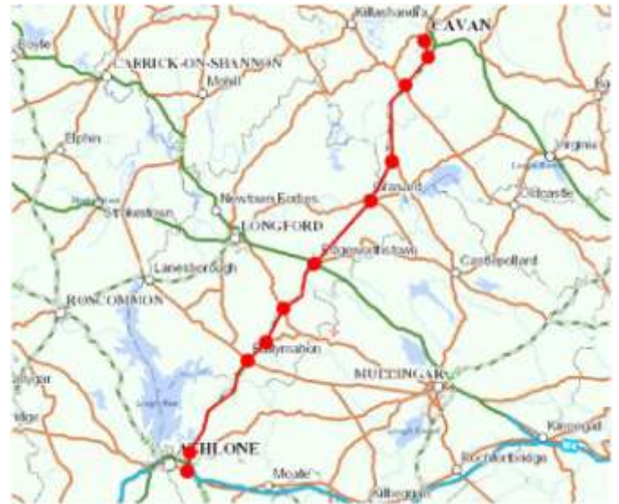
Figure 4 – Hypothetical route examined - route highlighted and nodes shown

that, once a week, a very heavy permit truck travels from Athlone to Cavan (see Figure 4). It is assumed that this journey occurs once a week for one year. The route is chosen as it does not contain any inter-urban roads and uses only roads on the non-primary road network. It covers 81 km of regional and national secondary roads. It is assumed that a single portable B-WIM system is used to cover all 26 counties in the Irish non-primary road network.