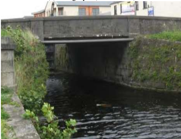
(b) Category 1 (feasible)