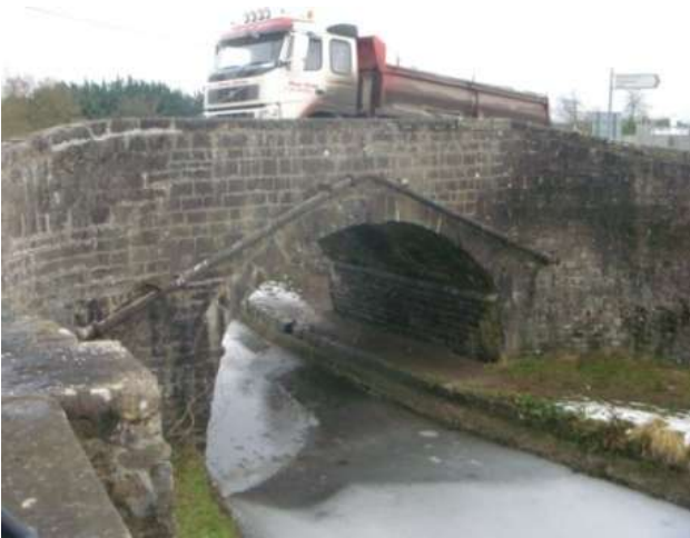
(a) Category 0 (not feasible)