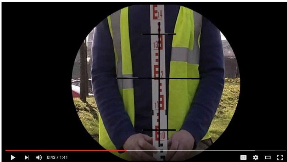
Figure 2: Observing an E-Type staff