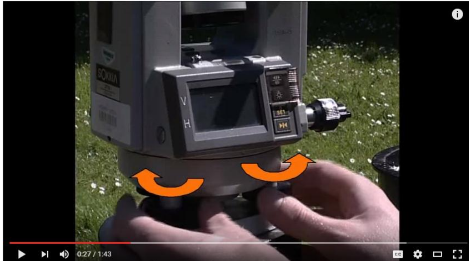
Figure 3: Levelling a theodolite