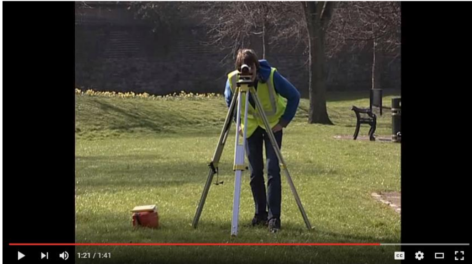
Figure 1: Levelling with an automatic level