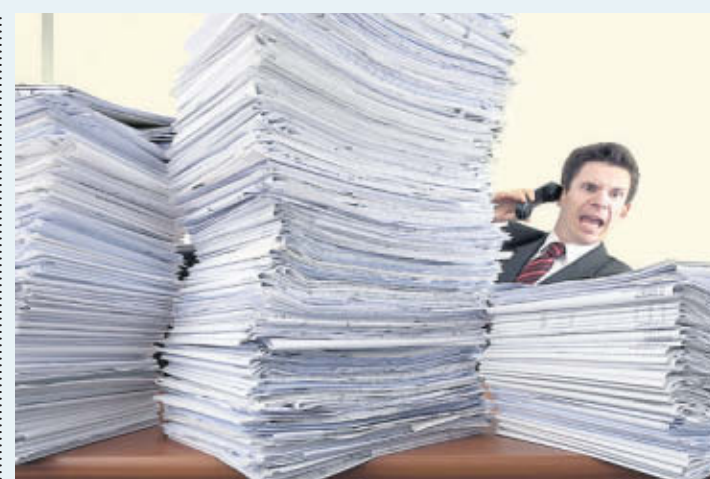
Questions are raised about how housing legislation is being drawn up

The final apartment size standards were issued on December 22, under section 28 of the Planning and Development Act 2000. They were ministerial "guidelines", to be referred to but not mandatory for councils to implement. Had they been issued as a ministerial directive, they would have had to be brought before the Dail