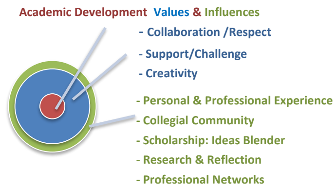
Figure 1 Range of values and influences on an academic development context

Within this role, it has been useful to continue to question the things that are either too familiar or too removed from my everyday concerns. My 'performance' as an academic developer comes from deeply within myself and therefore the constructs used are based on a mixture of personal beliefs, professional knowledge, practice and social context. Figure 1 shows these values and main influences on my work.