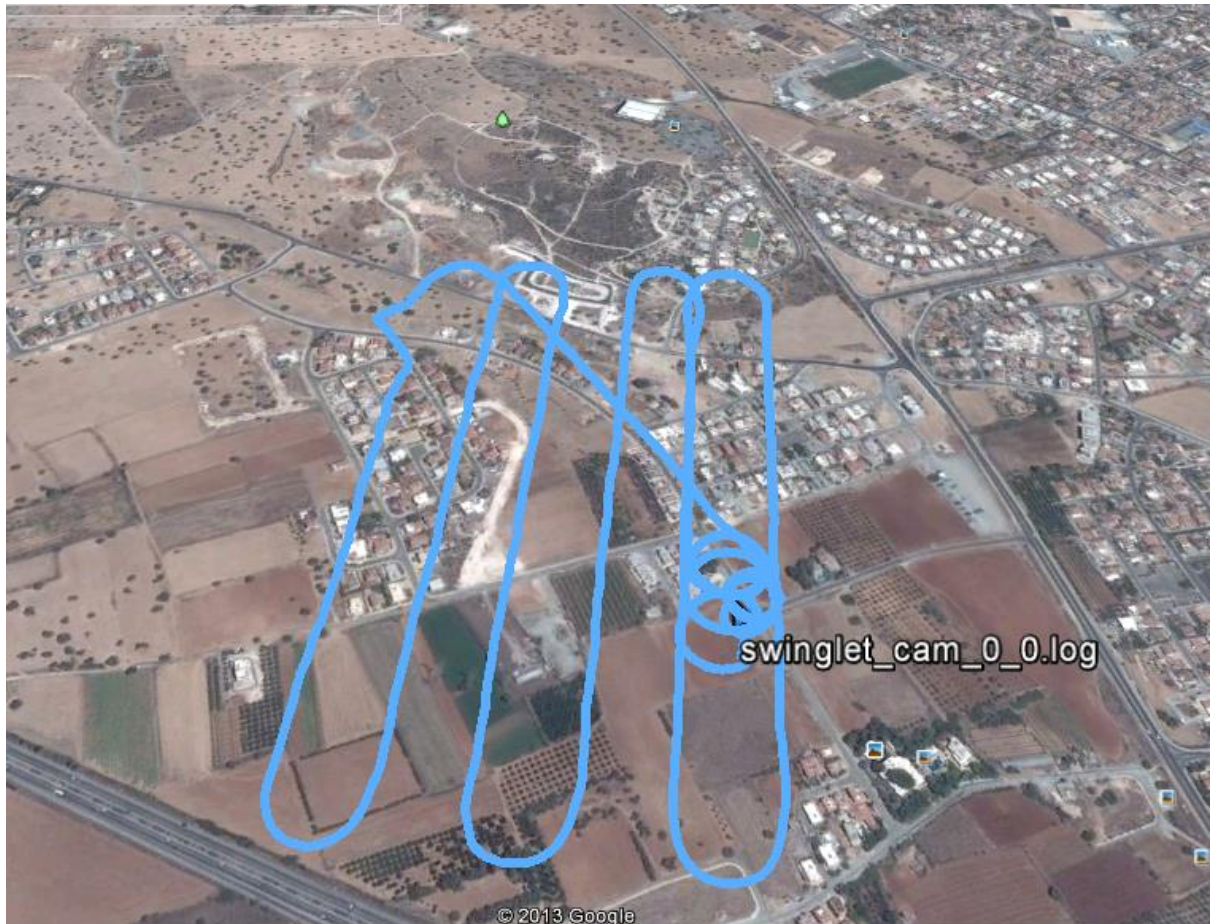
UAV flight path log including take-off and landing. (Copyright status unknown)