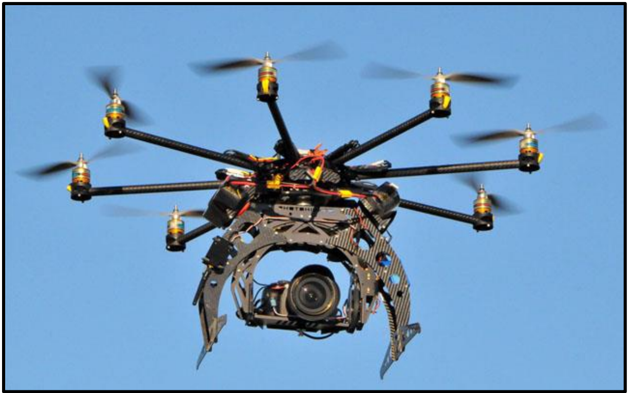
Mutlicopter (copyright status unknown)