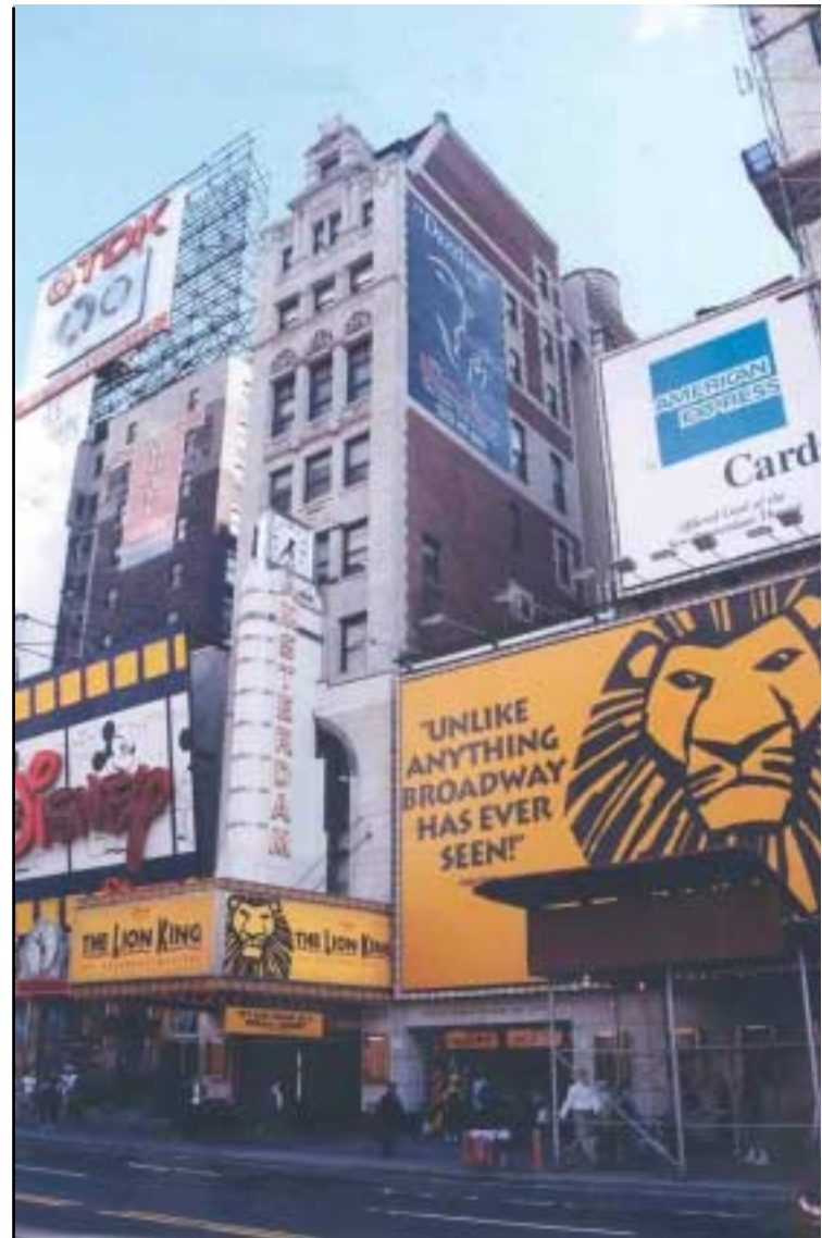
Figure 2: The New Amsterdam Theatre, Time Square, 42nd Street, New York designed by Herts and Tallant in 1903 and listed on the National Register of Historic Places. By the Early 1980s the building was vacant and in a state of disrepair. In 1997 the Disney Development Corporation completed the rehabilitation of the theatre, which involved cleaning and repairing exterior details and restoring the Art Nouveau interior finishes. The total rehabilitation costs eligible for federal credit amounted to $37,100,000 allowing a 20% tax credit of $7,420,000.

The rehabilitation must also be ‘substantial’, i.e., during a 24-month period selected by the taxpayer the ‘qualified rehabilitation expenditures’ must exceed the greater of $5,000 or the adjusted basis of the building and its structural components. The