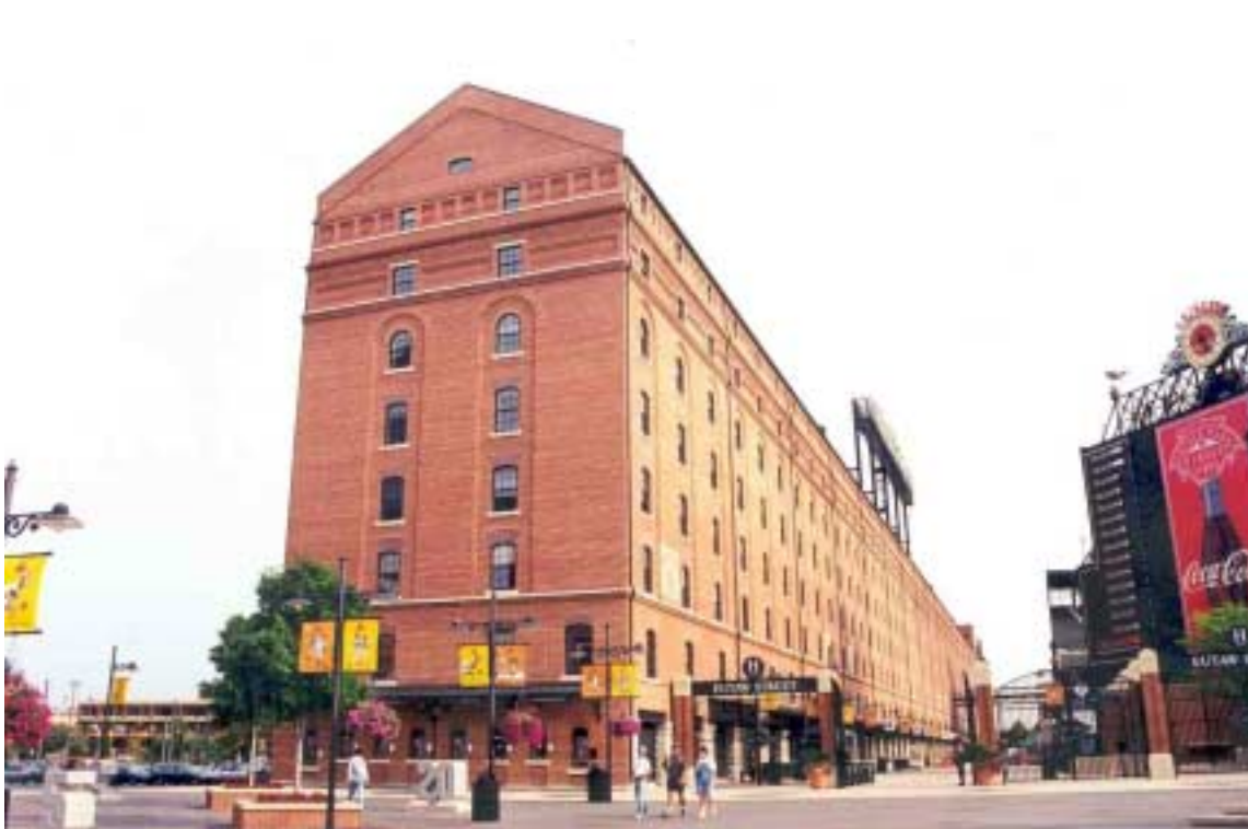
Figure 1: Baltimore to Ohio Railroad Warehouse, Camden Yards, Baltimore Orioles' Ball Park. Maryland 'state 106 law' was used to help preserve the historic building and retain the historic neighbourhood as part of a new development project.

More significantly the US courts have validated the use of state enabling laws that provide power to local governments to enact local historic district and preservation ordinances (the first such ordinance was created in 1931 as an added provision to a zoning ordinance in Charleston, South Carolina to prevent the looting of historic building interiors). The most prominent judicial ruling in this context is the 1978 decision by the US Supreme Court in Penn Central Transportation Company v. City of New York (438 US 104 - 1978). Penn Central attacked the New York City landmarks ordinance as unconstitutional because it prevented the company from building a fifty-five storey office tower on top of the historic grand central terminal in Manhattan. The New York City Landmarks Preservation Commission determined that the tower would overwhelm the terminal building. The Supreme Court ruled that the local ordinance, and by inference comparative ordinances elsewhere, were