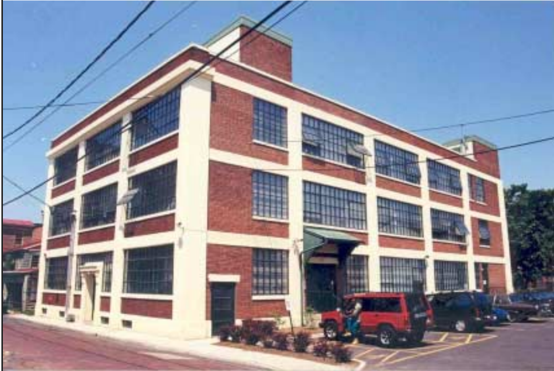
Figure 5: Rehabilitation of 10 Wood Street, Trenton, New Jersey, classified as a certified historic structure by the National Park Service in February 1993. The rehabilitation project carried out by the Wood Street Housing Partnership commenced in May 1994 with the assistance of the 20% federal historic rehabilitation tax credit. The building was placed in-service following completion in December 1994.