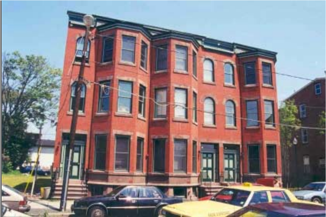
Figure 6: Rehabilitation of No. 210 Academy Street, Trenton, New Jersey (Academy Hanover Historic District): a timber frame and brick residence, constructed in circa 1900. The project involved the conversion of a single residence to two low-income residential units with the assistance of the both 20% federal historic rehabilitation tax credit and the low-income housing tax credit.