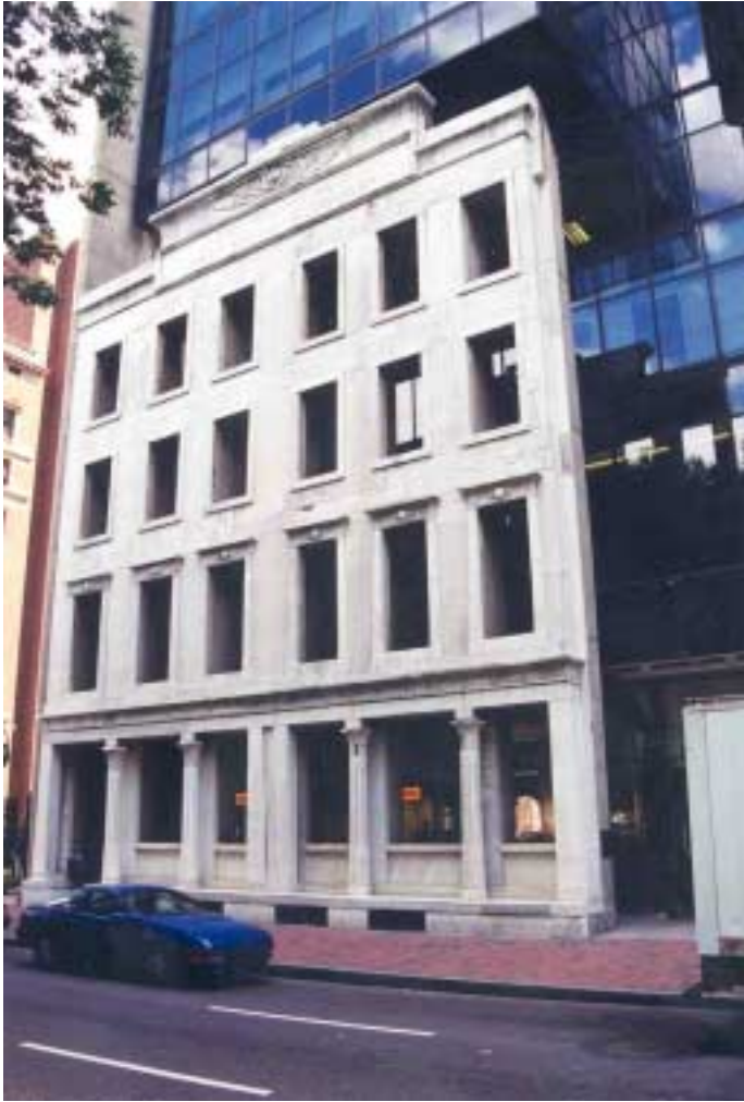
Figure 11: Façadism in Philadelphia

laws provide power to local governments to enact local historic districts and preservation ordinances, usually regulated by preservation commissions. These are able to protect historic resources from demolition, neglect or inappropriate alterations to private property and have been validated by the American court system, most notably in the Supreme Court judicial ruling of Penn Central Transportation Company v. City of New York in 1978.