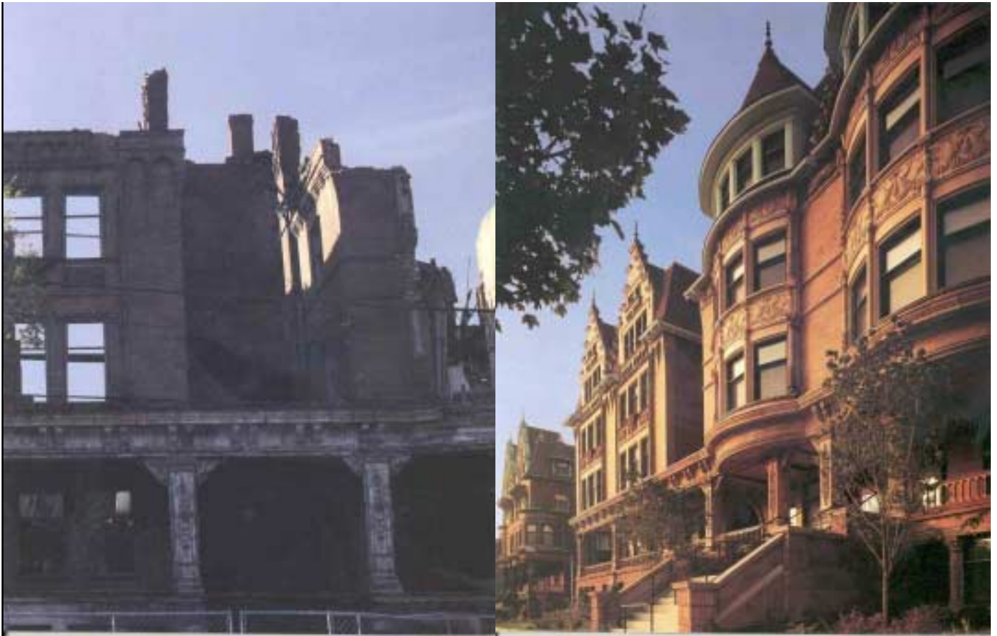
Figures 7A (prior to rehabilitation) and 7B (following rehabilitation): The Brentwood rehabilitation project at Parkside Avenue, Philadelphia. The project involved the rehabilitation of the near derelict Brentwood Building into forty-four residential units for use by low-income families and senior citizens with the assistance of the federal historic rehabilitation tax credit and low-income housing tax credit.