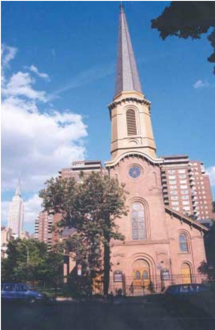
Figure 9: Holy Apostles Church, 9th Avenue and 27th Street, New York. The right to develop air space was transferred enabling the safeguarding of this church.