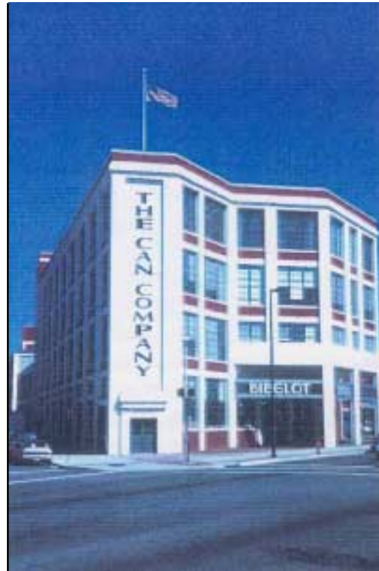
Figure 10: Signature Building, Norton Tin Can and Plate Company, Baltimore, Maryland

10-year property rehabilitation tax credit for the project from the Baltimore City Restoration and Rehabilitation Tax Programme. Under the programme the property tax assessment level of designated historic properties remained at pre-rehabilitation level for ten years. The minimum expenditure required was 25% of the market value of the property. The static tax assessment level remains constant upon the sale of the building to a new owner (Byrtus and McClelland, 2000)