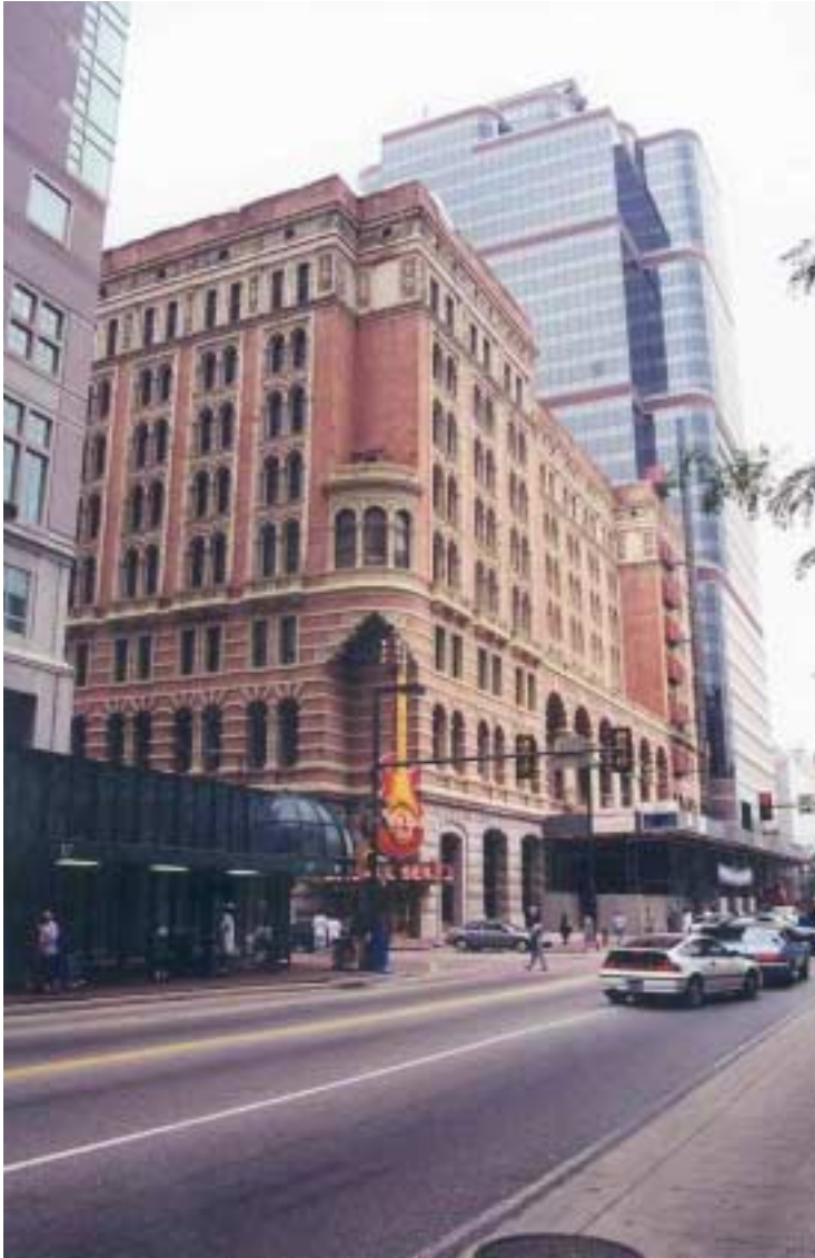
Figure 3: Rehabilitation of the Train Terminal Headhouse and Filbert Street Arcade, Philadelphia, completed 1885-1891 for the Reading Railway Company, is located on Market Street in Philadelphia. The building is certified in the National Register of Historic Places. Originally in office use, the building has been rehabilitated to provide retail, convention centre and hotel accommodation. Exterior work involved replacement of the roof, the re-pointing of masonry and the addition of shop fronts. Interior work included the restoration of the 'millwork' metal ceilings and plasterwork, in addition to the hotel adaptations.