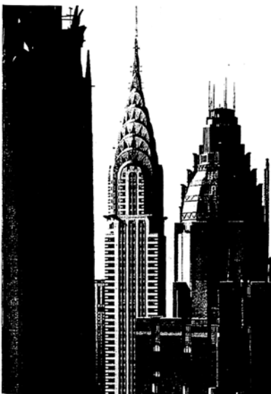
William Van Allen: Chrysler Building, New York City, 1930

It is ironic therefore to find that within this agrarian democracy conservatism would be celebrated and encouraged, where the dramatic opportunities that modernism would offer were firmly set within a neoclassical mindset. Perhaps it is no surprise to find Mies at home deep in the heart of America, in arguably America's true modern heart: Chicago. It should be remembered however that from the very earliest time Americans sought to forge a particular American identity in their public and private works, from their white painted houses to their grand neo-classical state capitols.