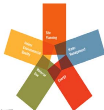
FIGURE 2: LEED categories.