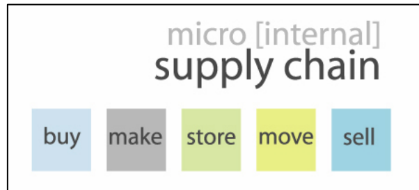
Figure 2 – The Internal Supply Chain

Most businesses can be described in terms of the five functions buy, make, store, move and sell - known as the “micro” or internal supply chain as shown in Figure 2.