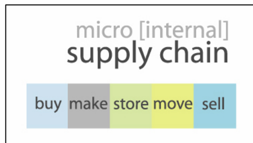
Figure 3 – Integration in the Internal Supply Chain

Traditionally these functions have been managed in isolation, often working at cross purposes. Supply Chain Management means thinking beyond the established boundaries, strengthening the linkages between the functions, and finding ways for them to pull together. A recognition that the whole is greater than the sum of the parts calls for more effective integration between purchasing and procurement (buy), production planning and control (make), warehouse management (store), transport management (move) and customer relationship management (sell), as illustrated in Figure 3.