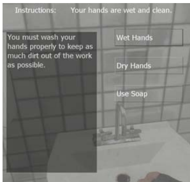
Figure 3: Interaction menu example - A player interacting with a wash hand basin.

Flexibility is again demonstrated in the approach taken in displaying the Heads Up Display (HUD). The HUD itself is derived from elements of the VGUI with Serious Gordon specific HUD elements derived from the HUD classes. Figure 4 presents the HUD from Half Life 2 and compares it with the HUD we developed for Serious Gordon. This approach provides a common look and functionality amongst HUD elements. Although the Serious Gordon elements provide different information, they do not come as a change to a player familiar with the Half Life 2 game.