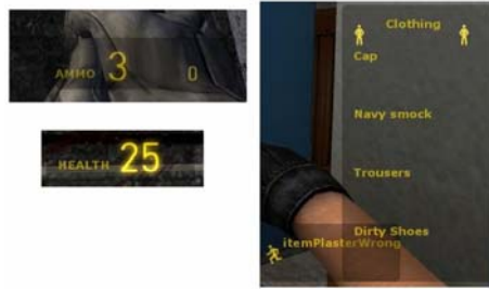
Figure 4: The Half Life 2 HUD (on the left) and the Serious Gordon HUD (on the right)

Flexibility is again demonstrated in the approach taken in displaying the Heads Up Display (HUD). The HUD itself is derived from elements of the VGUI with Serious Gordon specific HUD elements derived from the HUD classes. Figure 4 presents the HUD from Half Life 2 and compares it with the HUD we developed for Serious Gordon. This approach provides a common look and functionality amongst HUD elements. Although the Serious Gordon elements provide different information, they do not come as a change to a player familiar with the Half Life 2 game.