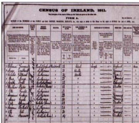
Figure 2: Census Return for 13 Kildare St. – Waiting staff of Shelbourne Hotel