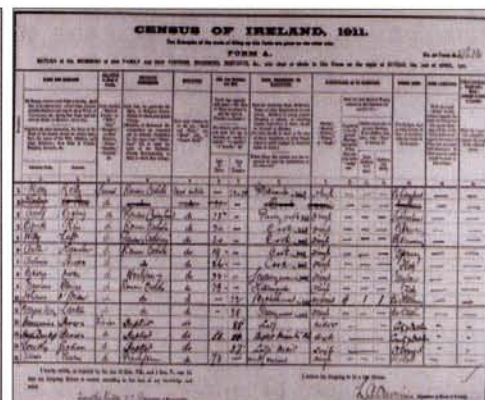
Figure 3: Cooks and Kitchen Workers living in The Shelbourne Hotel