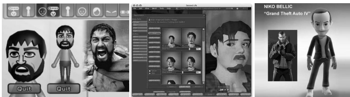
Figure 2: Nintendo Wii avatars [10], Second Life avatar [11] and Xbox 360 avatars [12].

The LOK8 avatar will be human-like so that people will communicate with it in a normal manner. This avatar will also be able to display a full range of non-verbal communication. Falling somewhere on the visual scale (see Figure 2) between the Nintendo Wii avatar [10], which is simplistic but still portrays a human and the Second Life avatar [11] which is more realistic in appearance. The Xbox 360 avatar [12] falls in the middle; it has enough detail to show a wide variety of human-like movement and expressiveness. It is vital that the LOK8 avatar creates the illusion of life, and thus suspends the user's disbelief [9].