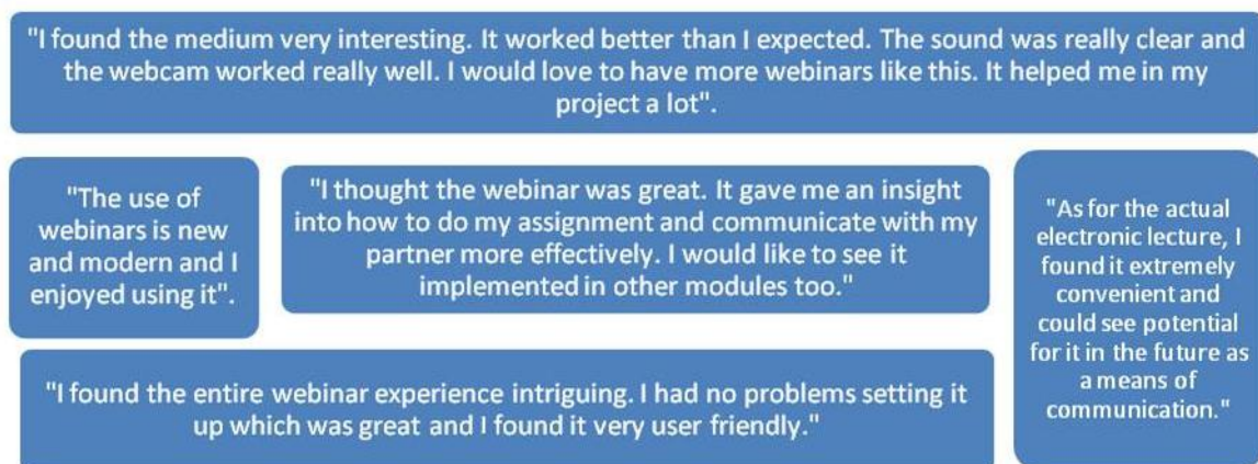
Figure 6.2: Student feedback comments on the TechKnow-Share project

Clickers were used to obtain feedback from students on the use of the wiki. Overall, students felt that the wiki enabled team members to collaborate, and improve communications with each other. In some cases, students felt that the wiki helped reduce conflict in the group as it assisted in members meeting deadlines, and work by each author could be viewed on an ongoing basis.