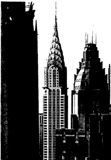
William Van Allen: Chrysler Building, New York City, 1930

It is ironic therefore to find that within this agrarian democracy conservatism would be celebrated and encouraged, where the dramatic opportunities that modernism would offer were firmly set within a neoclassical mindset. Perhaps it is no surprise to find Mies at home deep in the heart of America, in arguably America's true modern heart: Chicago. It should be remembered however that from the very earliest time Americans sought to forge a particular American identity in their public and private works, from their white painted houses to their grand neo-classical state capitols.