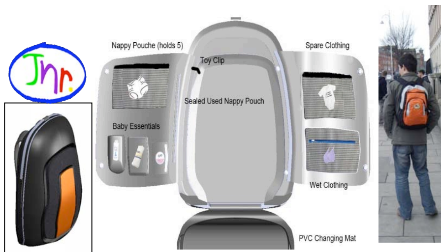
Figure 3: myPak Jnr: A backpack which opens to become a changing unit