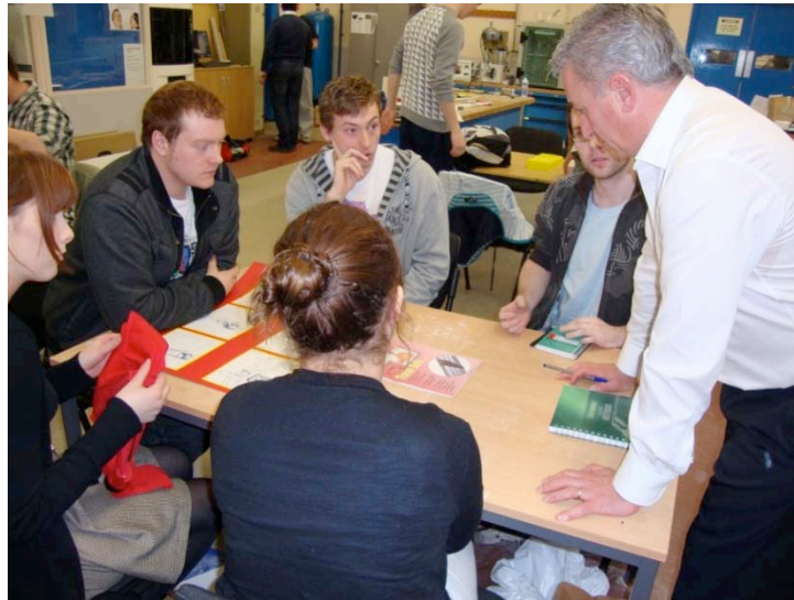
Figure 6: Initial Meetings for Session 2009-10

The structure of the competition was altered significantly for its second year. It was decided that there will be one national award. The prize on offer is that Tidi Solutions will offer to take the winning product to market and pay royalties to the students. It was stressed to the students that they have the choice of whether to licence their design to Tidi or not.