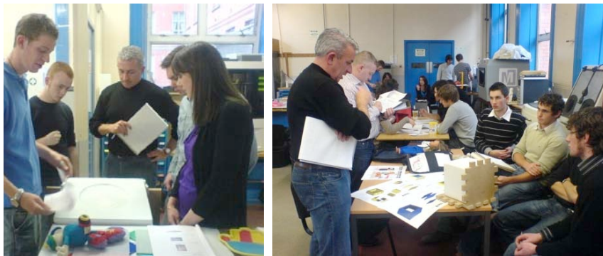
Figure 1: Project Meetings with Tidi representatives

It was also concluded that a more interactive approach was required and future sessions were run, not as a presentation session, but as a show-and-tell session, where the students demonstrated their concepts briefly and company representatives were given far more time to question the students on various aspects of the design. Some images of these meetings are shown in Figure 1.