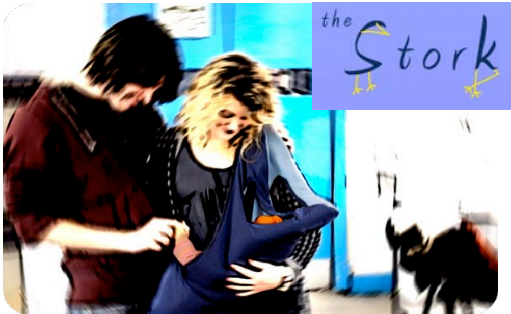
Figure 2: The Stork: a new baby sling

A variety of innovative products were produced in the course of the project. Shown in Figs. 2 and 3 is “the Stork”, a baby sling which can be attached to a buggy to that the child can be easily lifted out of the buggy, and “myPak”, a baby changing unit stored in a conveniently-sized backpack for easy access. All groups produced virtual and physical prototypes of the products they designed.