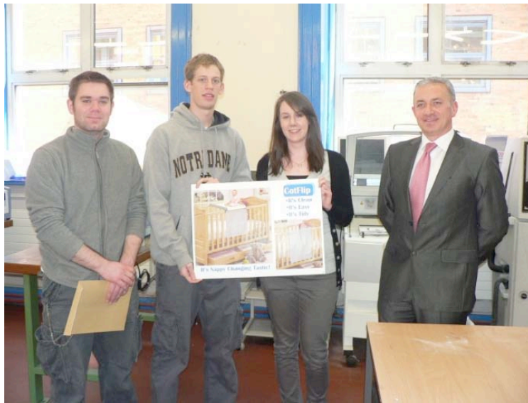
Figure 4: Benefits from Collaborative Project to Students, Company and Institute

Students and company were asked for feedback on their experiences and what they felt that they gained from the project. The results are summarised in Figure 5.