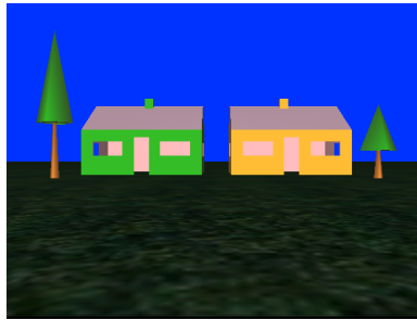
Figure 5. The final state of the visual context.

framework meshes well with psycholinguistic results that point to the role of attention within human reference resolution processes.