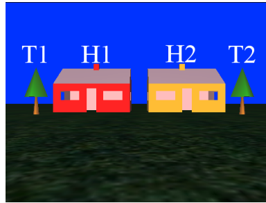
Figure 4. Example visual context. H1 = red house, H2 = green house.