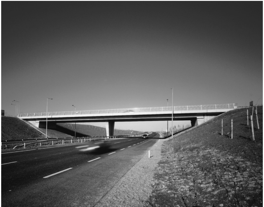
Figure 1.2 Bridge on Arklow bypass, Ireland (Source: Arup. Photographer: Studioworks).

Techniques allowing uncertainty to be incorporated into criterion scores within the SAW Model, together with the various systems for assigning importance weights to the criteria, are outlined. Environmental Checklists are important applications of the SAW Model, and three types are explained in the text. The chapter concludes with a case study, outlining the application of the model to choosing a transport strategy for a major urban centre. Chapter 13 explains the Analytic Hierarchy Process (AHP) Method, a widely used decision model in the United States. Its use of hierarchies together with a seven-point scale to calculate the priorities assigned to the different options under consideration is detailed. In conclusion, Chapter 14 deals with Concordance Techniques, a set of multicriteria models used extensively throughout Europe to resolve decision problems in areas including engineering development. Worked examples of the different types of decision methods are given throughout the text.